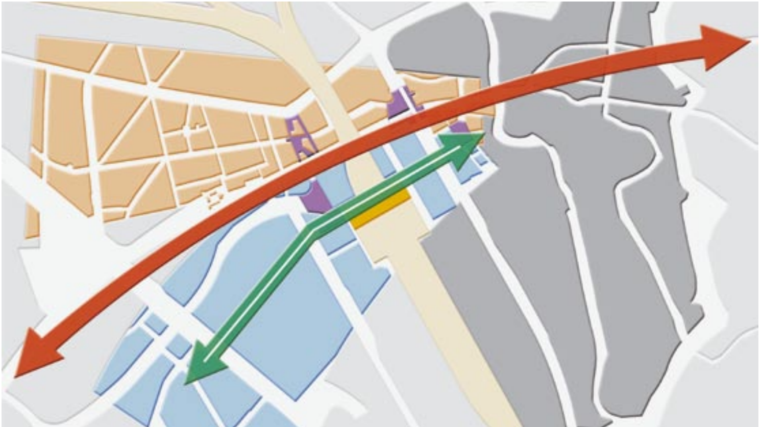
Masterplan 'Visiekaart'. The red arrow indicates the City Corridor; the green arrow indicates the Centre Boulevard.