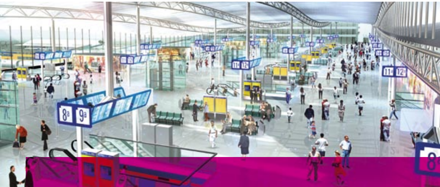
Impression of the new station concourse. (source: gemeente Utrecht / ProRail 2006, design by Benthem Crowwel Architecten)

all the flows very effectively. To the east, the terminal will have to be connected to the Hoog Catharijne shopping centre and the Nieuwe Stationsstraat (New Station Street), and to the west to Jaarbeursplein. To free Westplein from all through traffic, the light rail from Nieuwegein will be moved to the western side of the station, parallel to the railway.