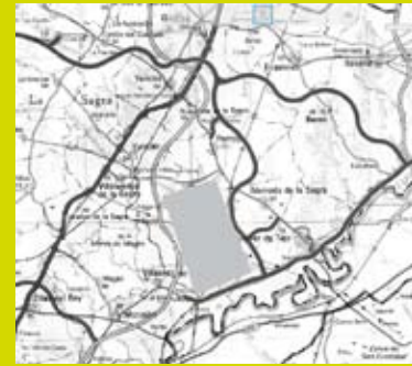
The La Sagra area between Madrid and Toledo.

Several train maintenance workshops for the high speed network are located in La Sagra and form an important element for the further development of the region, providing as they do access to existing and future lines. In addition, a new station is being planned for use in emergency situations in the Madrid railway system, such as critical technical or engineering failures due to accidents, natural disasters or terrorist attacks.